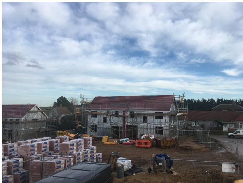
Two sets of semi-detached houses have sprung up since March

Work installing a foul water drainage system entailed four weeks of roadworks while the drains were connected to the pumping station at Alderton.