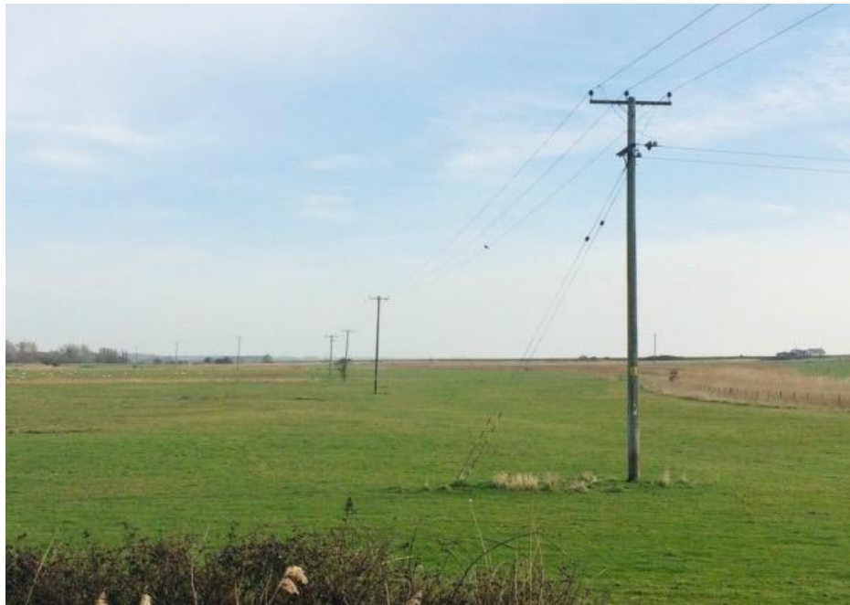
Electricity cables at Shingle Street have now been underground

In September an event called Tea on the Beach took place in aid of conserving the historic environment of the area.