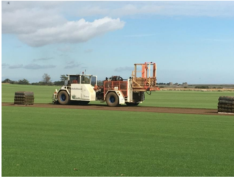
A turf harvester at work in August

Highways: One of the challenges for rural communities has been the increase in heavier and wider vehicles using roads and lanes which were not built for their weight or dimensions. In Bawdsey heavy tractors and trailers and high-sided turf lorries plus many vehicles used by Scottish Power in the building of the wind farms have caused major concern. These vehicles sometimes have to mount pavements or drive on to verges to pass one another, causing damage and alarm. Stretches of Red House Lane and Long Lane are broken up and fill with water but are not a priority for Highways.