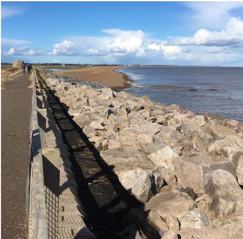
New rock armour shoring up the sea wall at East Lane. View towards Shingle Street

But community feeling is strong in this small village of 195 households (which also comprises the hamlet of Shingle Street a mile north of Bawdsey) and the year has been punctuated by numerous community events. This report includes for the first time a paragraph about farming in the area.