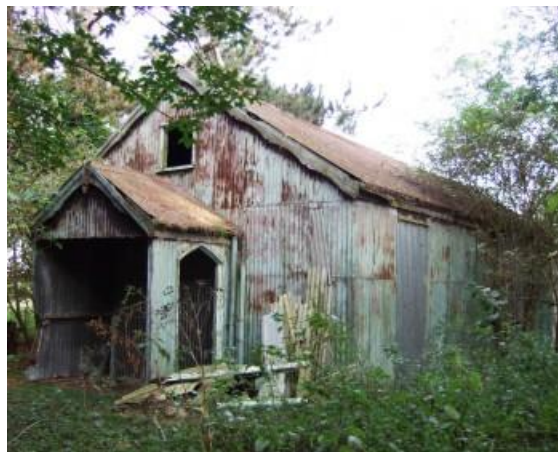
Chapel in early twentieth century and now-dilapidated

The East Suffolk Building Preservation Trust has undertaken to spearhead an attempt to renovate a Victorian tin chapel on land adjacent to the amenity site, owned by PGL on Bawdsey Manor grounds. PGL is willing to give up the chapel and a piece of surrounding land to the trust. A feasibility study was carried out in 2019 and the interior has been shored up with scaffolding to halt further deterioration of the structure. The recommended usage by the consultancy firm Cultural Engine is for a resource centre for over eight groups from different universities which are carrying out research on the Deben Estuary and its salt marsh.