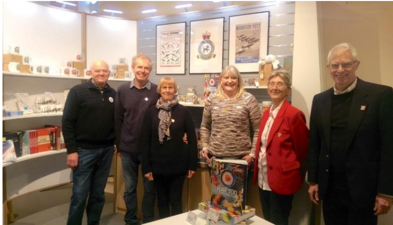
The shop team at the award-winning shop