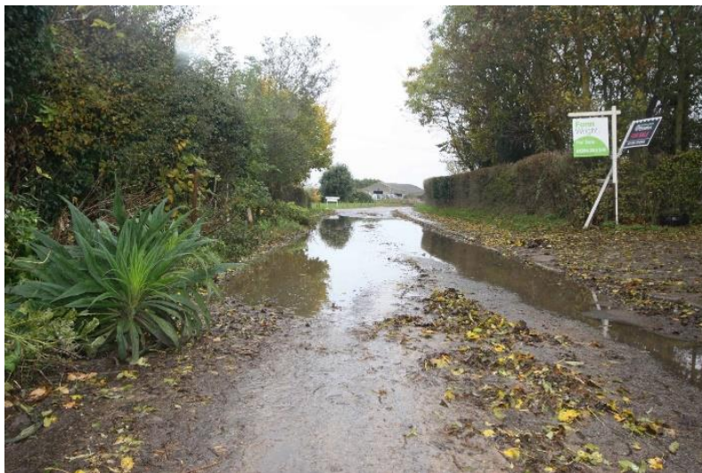
Flooding along East Lane

Moreover, in cases of heavy rain, mud and sand spill on to roads and can block drains causing localised flooding. In October 2019 the storm rains caused extensive flooding up to 2 inches deep in places. Parish councils on the peninsula are getting together to log all the instances where the roads and potholes need repairing and drains need sluicing out more regularly to present to Highways.