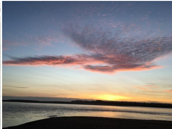
View across to Felixstowe on 31 st December 2021