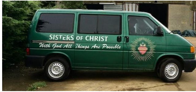
Sign used in the film The Power and the minibus used for the religious sisters at the convent

Bawdsey Village Fete: Despite an overcast day, people flocked to the recreation ground on the Bank Holiday Monday and a record £5,600 was made. The dog show was especially popular as was the tombola, BBQ and teas.