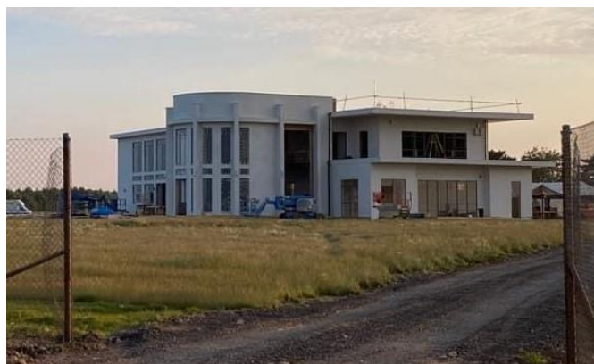
The trailer park for actors and associated film crew and the completed film set