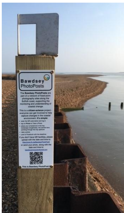
Photo posts: An initiative to install a chain of photo posts to monitor the movement of shingle along the coast and the mouth of the estuary has begun. Each post has a “tray” on which a phone can be stood to take a photo of the beach profile. Four have been installed: at East Lane Point, along the sea wall looking towards Shingle Street, Shingle Street itself and at the mouth of the Deben. Photos can be uploaded and sent to the relevant Facebook page. More are planned along the coast. Redshank information panels have been added subsequently.

Bawdsey Quay and Ferry Road: Bawdsey Parish Council approved the marking up of car parking spaces on the Quay following random and dangerous car parking over the previous summer. Both Suffolk County Councillor Andrew Reid and East Suffolk Councillor James Mallinder contributed to this from their budgets. The parish council is also intending to rationalise the parking along the approach to the Quay because of severe erosion of the river wall and the danger to public safety of overparking.