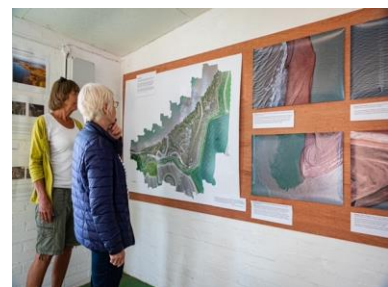
The former bus shelter now the Deben Marine Centre

Bawdsey Parish Council: Following a consultation with the community regarding how to use any legacy funding from Sister Pictures, BPC found most support for placing some benches and planters along the approach road to Bawdsey Quay. This would not only provide an amenity for visitors but would also protect the verges and limit inappropriate parking.