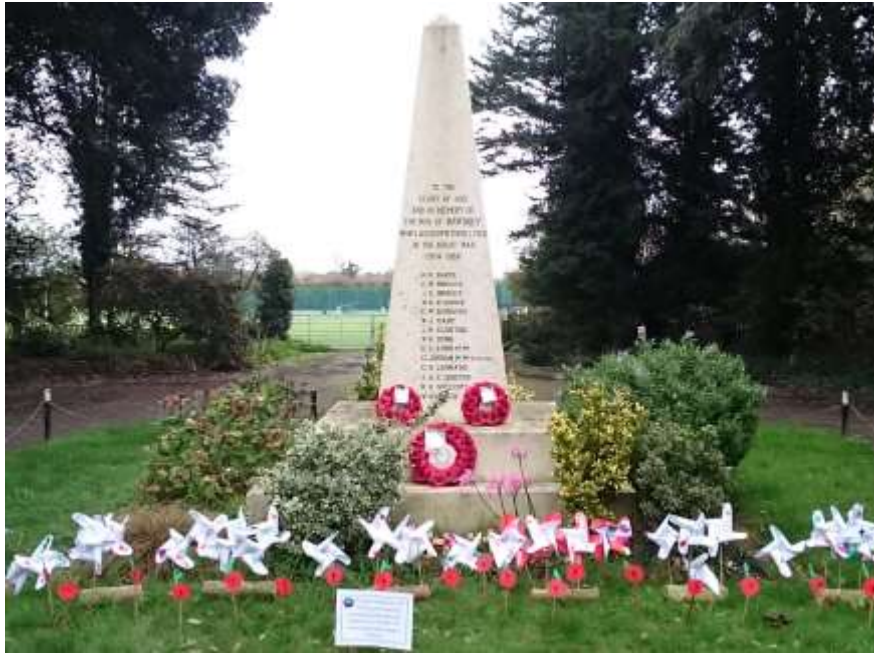
Pupils from Bawdsey Primary School later lay poppies and windmills

High Tide: An extremely high spring tide on 19 th November flooded Bawdsey Quay.