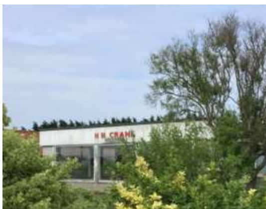
The old show room of Cranes Garage

Planning Meeting: A planning meeting was held on June 4 th via Zoom to discuss a third planning application submitted to East Suffolk to develop the Cranes Garage site that had fallen into disrepair. Application DC/20/1404/FUL entailed the demolition of the car showroom, the construction of 3 dwellings and garages and conversion of former workshops buildings to employment units plus one holiday unit at first floor.