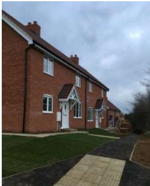
New footpath at Manor Farm Gardens

Orwell Housing Development: A new 100 metre walkway in front of the new houses was completed, enabling pedestrians to avoid walking on the road on their way to Alderton. The PC has rejected a new planning application for three detached houses on the same site.