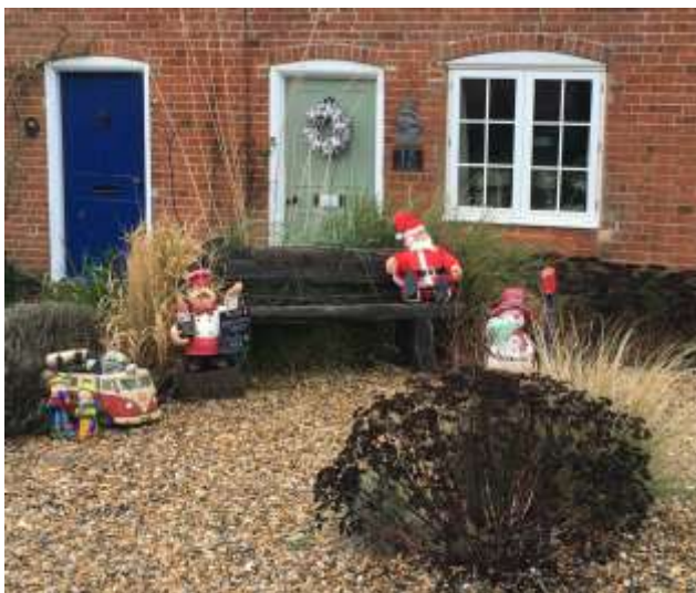
Winning entry, number 15 The Street

A new initiative was Deck the Village for Christmas which invited residents to decorate their front gardens in a competition to raise funds for Bawdsey Primary School with an entry fee of £2.50.