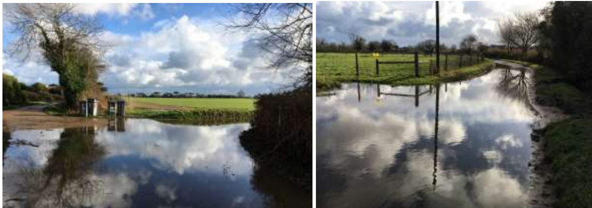
Flooding in Long Lane and Red House Lane

Flooding again: 2020 was characterised by hot spells and torrential downpours which caused flooding in the same places within the village each time. On 27 th another downpour occurred, and the drains could not cope with the volume of water.