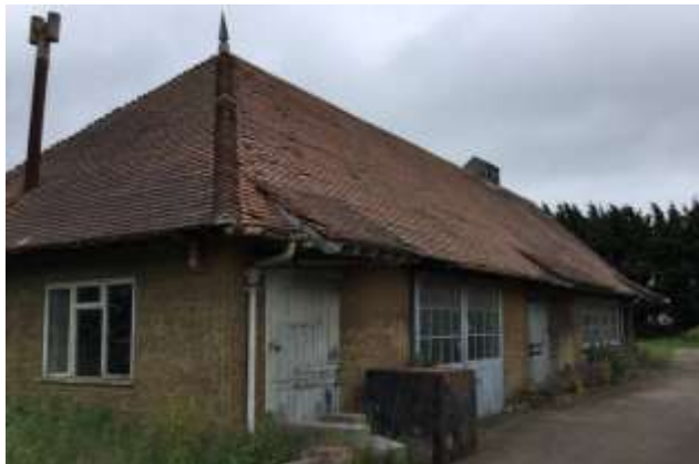
The old smithy and adjacent workshop

The parish council approved the application with several conditions, and it was eventually passed by East Suffolk Council in November.