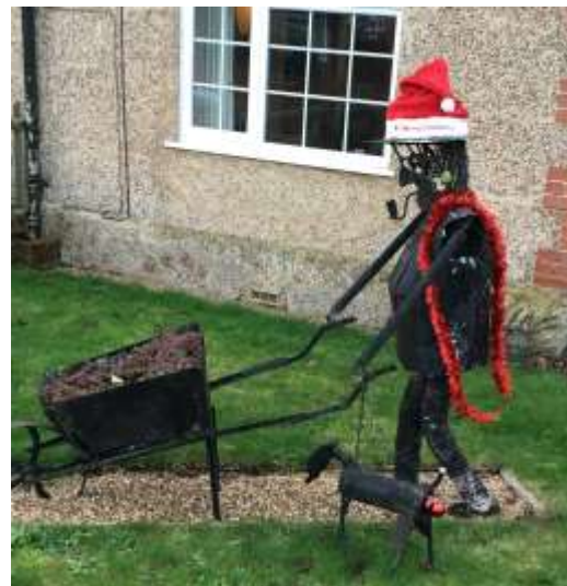
Number 25 The Street