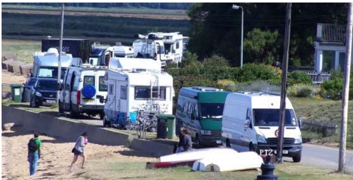
Camper Vans parked along the riverside

Excess Visitors: Disquiet about visitor numbers and specifically the number of camper vans at the Quay have been expressed by residents. Camper vans are causing erosion of the river bank, litter bins are overflowing and there have been fears of potential accidents.