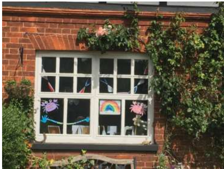
A window display in Fern Terrace showing support for the NHS

Clapping for Carers: The end of May saw the suspension of the Clapping for Carers initiative. It not only provided a means of showing appreciation but for those shielding, it also gave the opportunity of interacting with neighbours outdoors particularly on sunny evenings.