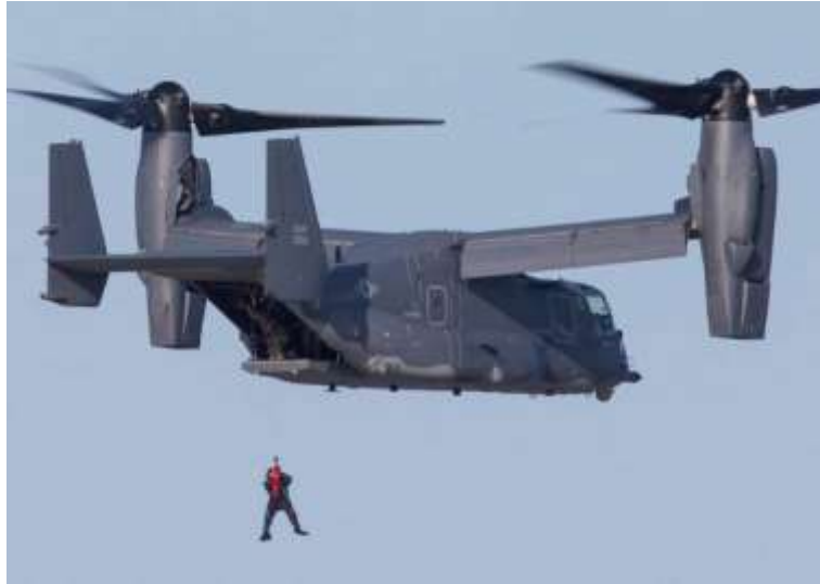
Airman being winched up from the sea at East Lane.

American helicopter exercises by 352d Special Operations Wing took place at East Lane on 9 th June. Based at Mildenhall the unit is part of the Air Force Special Operations Command. It is the only Air Force special operations unit in the European Theatre. The noise was deafening!