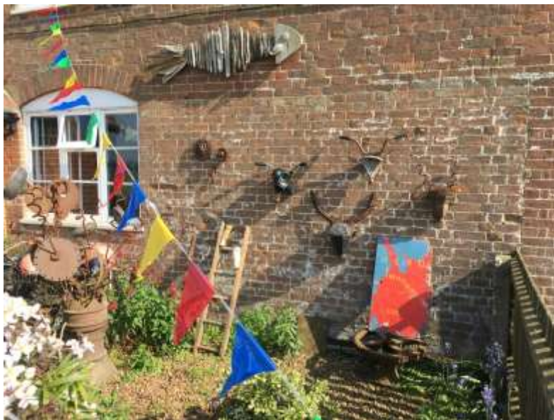
A house decorated for VE Day on East Lane

VE Day Friday 6 th May: Unlike some villages, Bawdsey had no communal celebrations of VE Day. A few houses decorated their properties with bunting and neighbours enjoyed a glass of wine together.