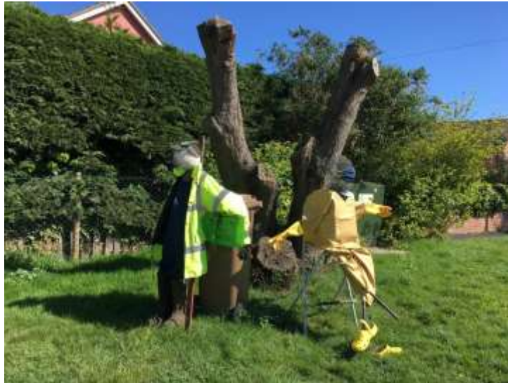
Scarecrows at the junction of Red House Lane and The Street

VE Day Friday 6 th May: Unlike some villages, Bawdsey had no communal celebrations of VE Day. A few houses decorated their properties with bunting and neighbours enjoyed a glass of wine together.